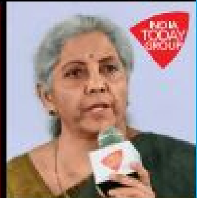
Nirmala Sitharaman Finance Minister